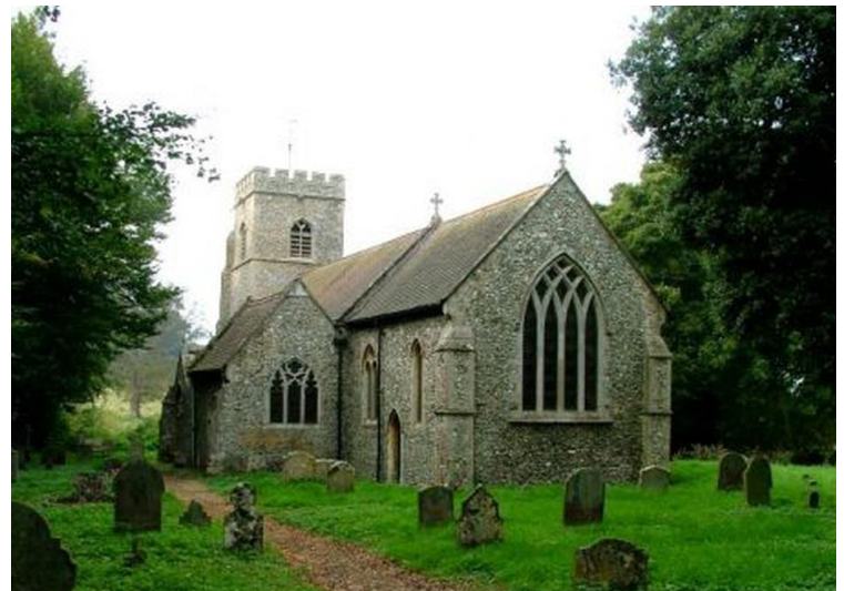
St Mary's Anmer