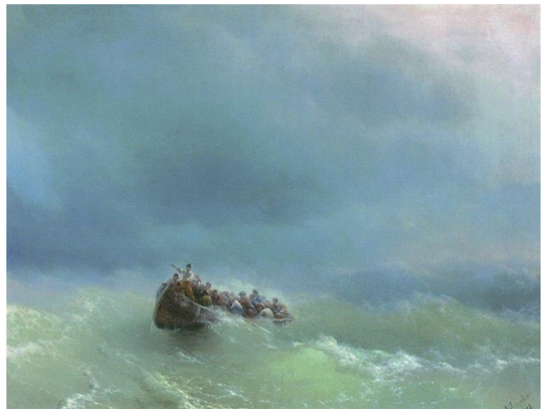
'On the Storm' by Ivan Aivazovsky, 1872