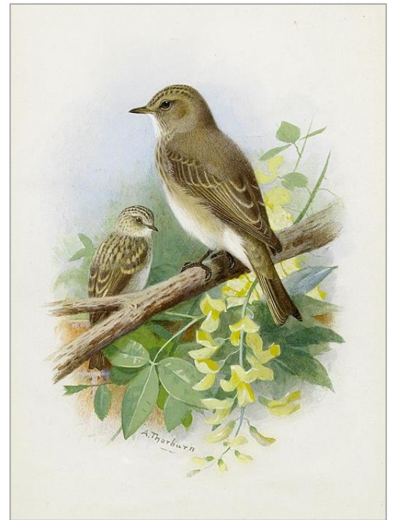
'Spotted Flycatchers' by Archibald Thornburn, 1860–1935 Public Domain