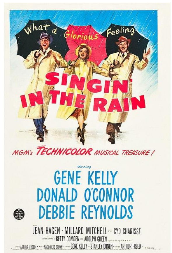
Poster for the American theatrical run of the 1952 musical film Singin' in the Rain