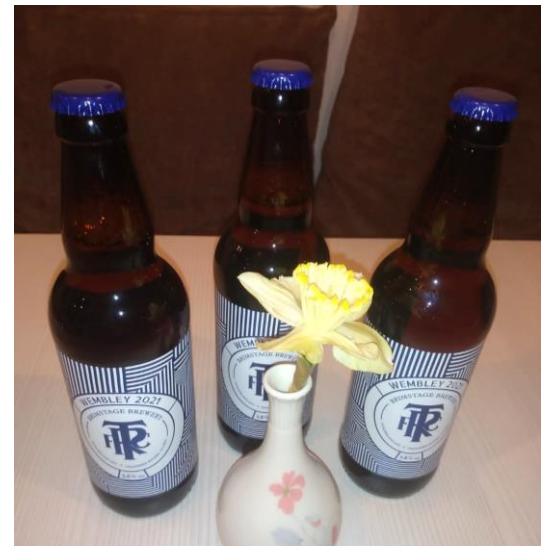
Tranmere Rovers commemoratives!

If you are offered a vaccine jab, take it, and be thankful.