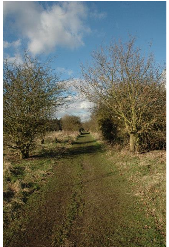
Old Railway track, Ingoldisthorpe