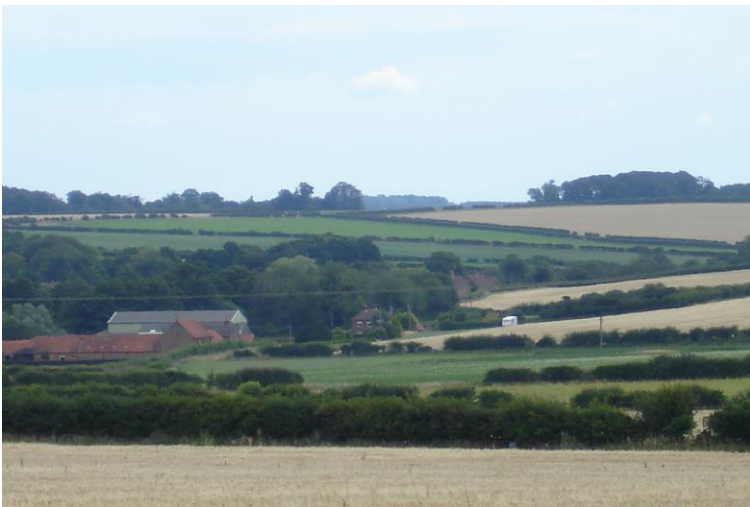
Toward Shernborne from Mill Road