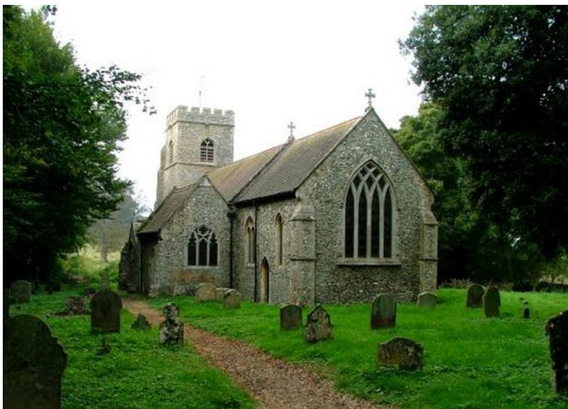
St Mary's Anmer