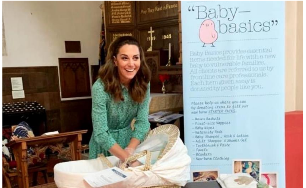
HRH The Duchess of Cambridge volunteering at Baby Basics

The Duchess asked many questions about the work of Baby Basics and built a Moses basket to be delivered to a mum in need.