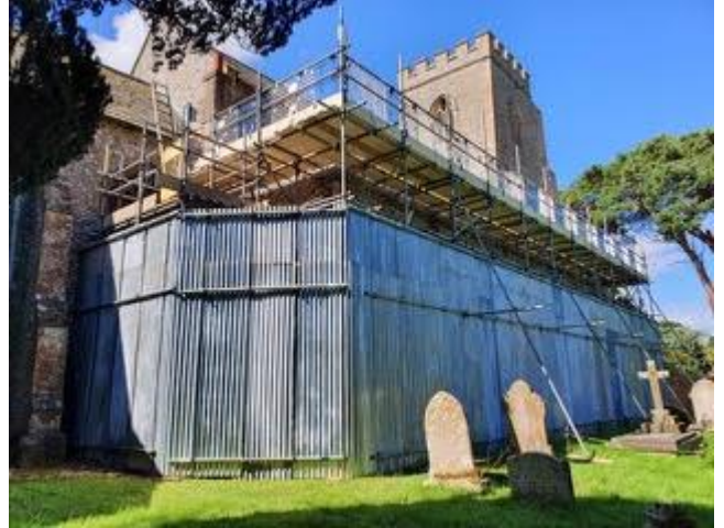
Work under way at St Michael's

Sue says, "The scaffolding firm worked constantly for two days erecting the impressive scaffold and we all hope that this proves to be a safe start to enable the roofers to make a safe and secure restoration. I think it might be interesting for people to see."